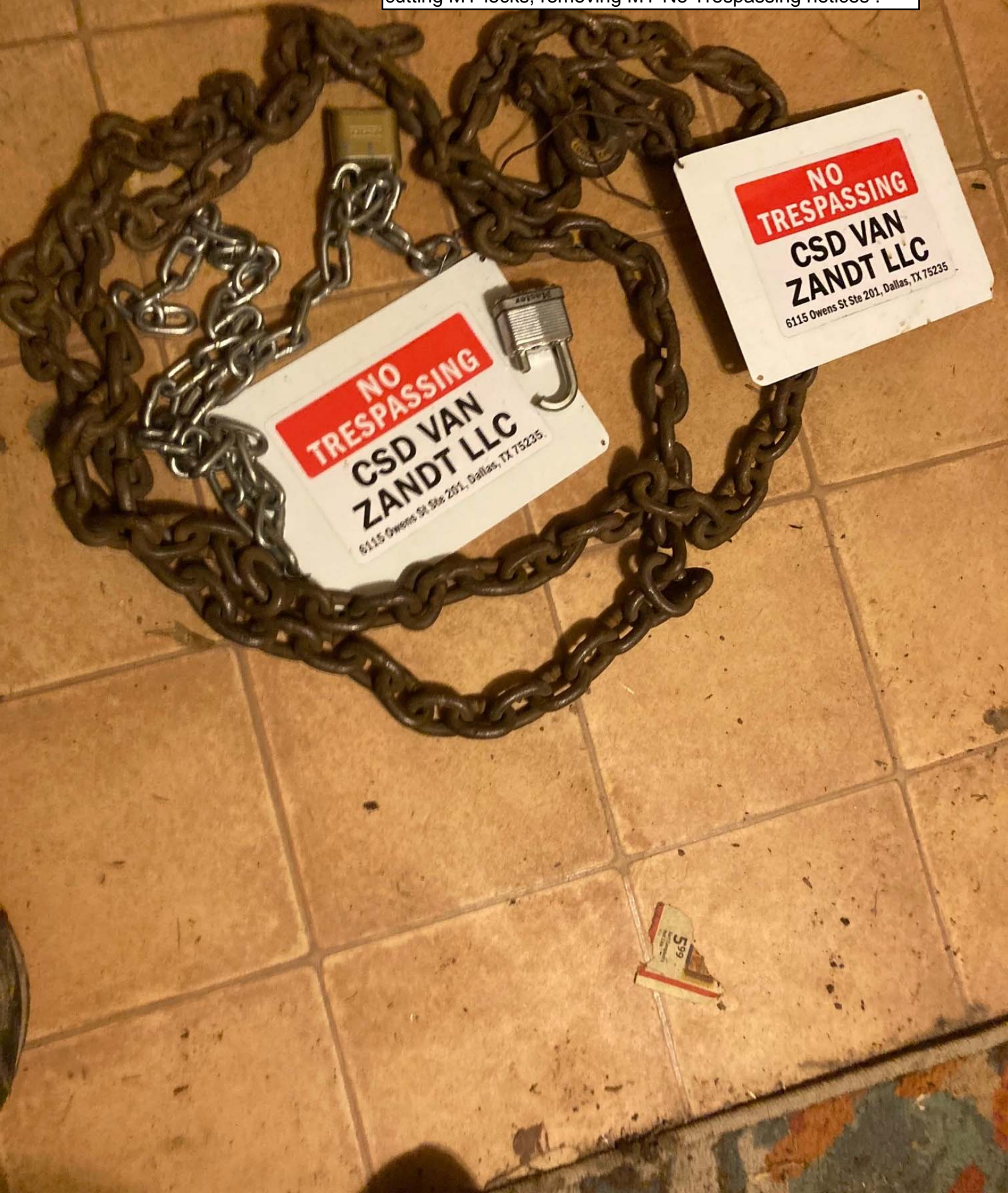
Exhibit 2 - "Battle at the Gate" - the hardware - 'taking turns with the guillotine". CSD only made themselves 2 signs - just for me. The heavy chain and lock was MINE. CSD kept cutting MY locks, removing MY No Trespassing notices .